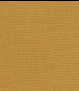
BREAK - 8