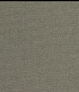
BREAK - 2