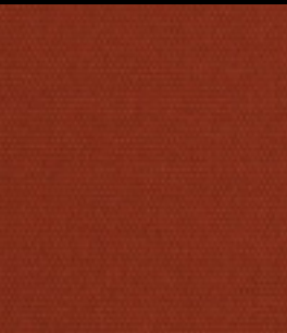
BREAK - 10