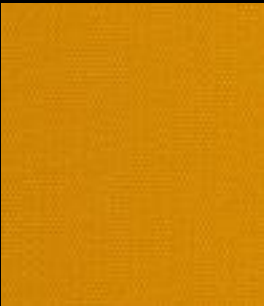
BREAK - 7