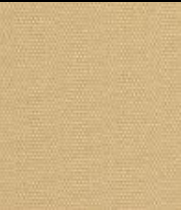
BREAK - 3