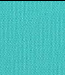
BREAK - 12