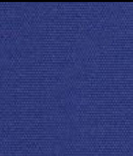
BREAK - 13