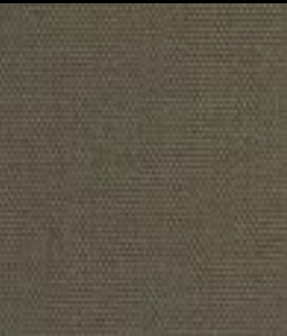
BREAK - 4