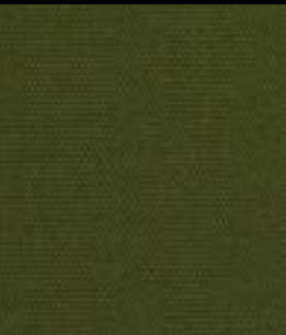
BREAK - 5