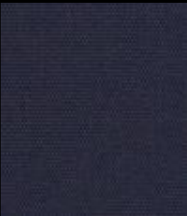
BREAK - 14