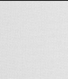
BREAK - 1