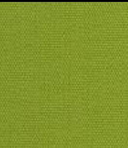
BREAK - 6