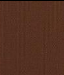
BREAK - 15