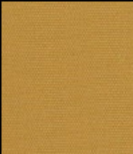
BREAK - 8