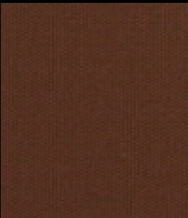
BREAK - 15