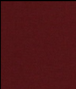
BREAK - 11