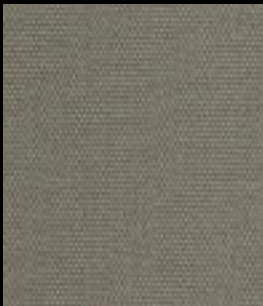
BREAK - 2