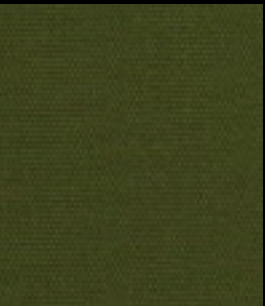
BREAK - 5