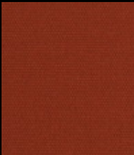
BREAK - 10