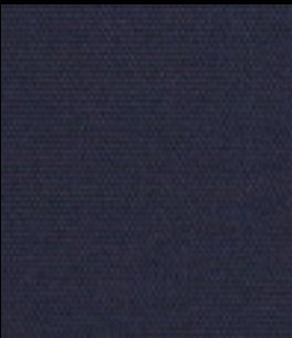
BREAK - 14