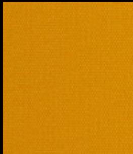
BREAK - 7