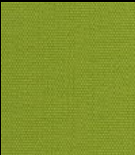
BREAK - 6