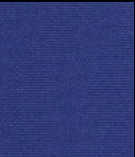
BREAK - 13