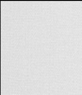
BREAK - 1