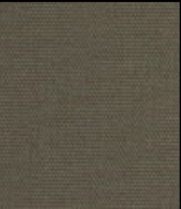
BREAK - 4