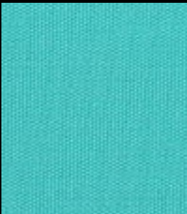
BREAK - 12