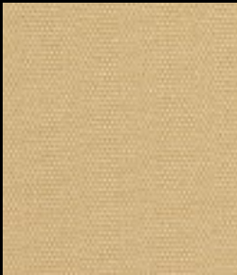
BREAK - 3